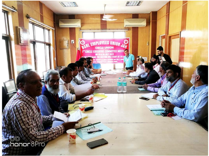
Another view of the CEC members.