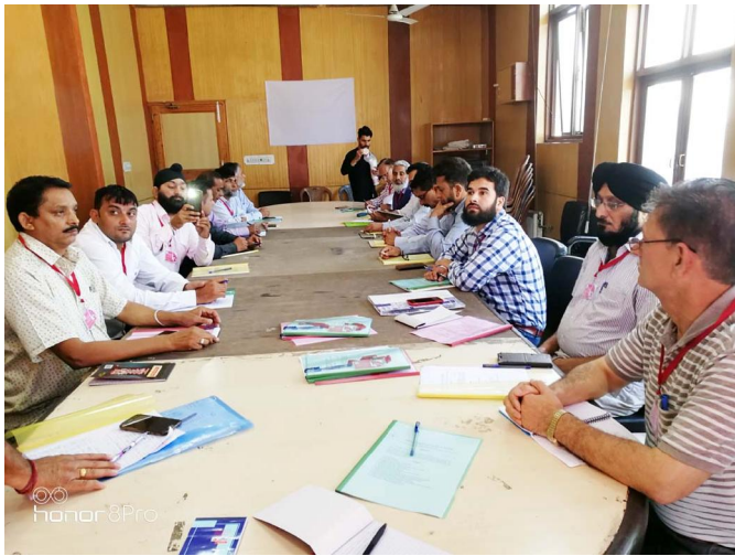
View of the CEC members.